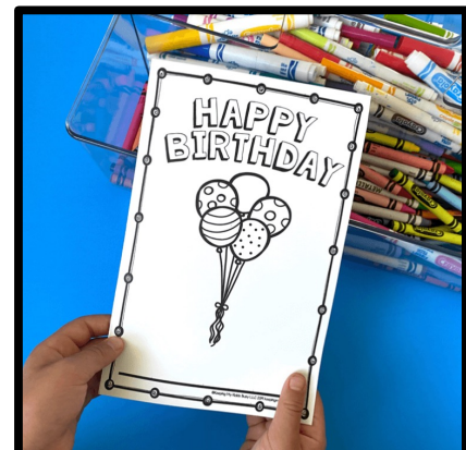
Unit 9: Cards