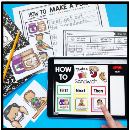
Unit 4: Expository