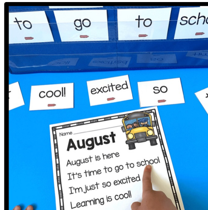
Unit 8: Poetry