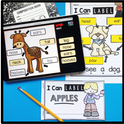
Unit 1: Labeling