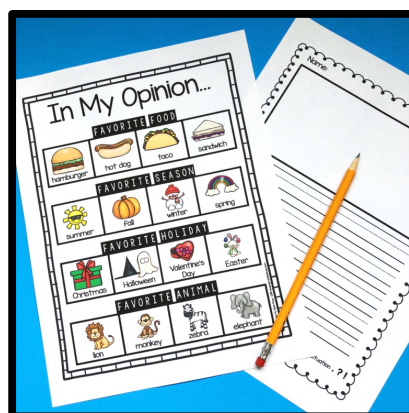
Unit 5: My Opinion