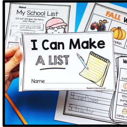
Unit 2: Lists