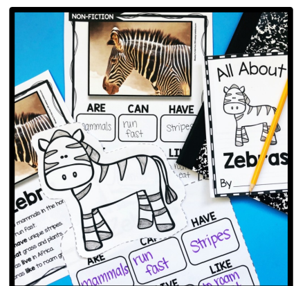
Unit 6: Nonfiction